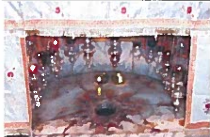
(Birthplace of our Lord in Bethlehem.)

Why not take a Lenten journey with us to the Holy Land! Don't delay-register now! Please check out the bulletin board for more information or stop or call the parish office to receive a detailed brochure.