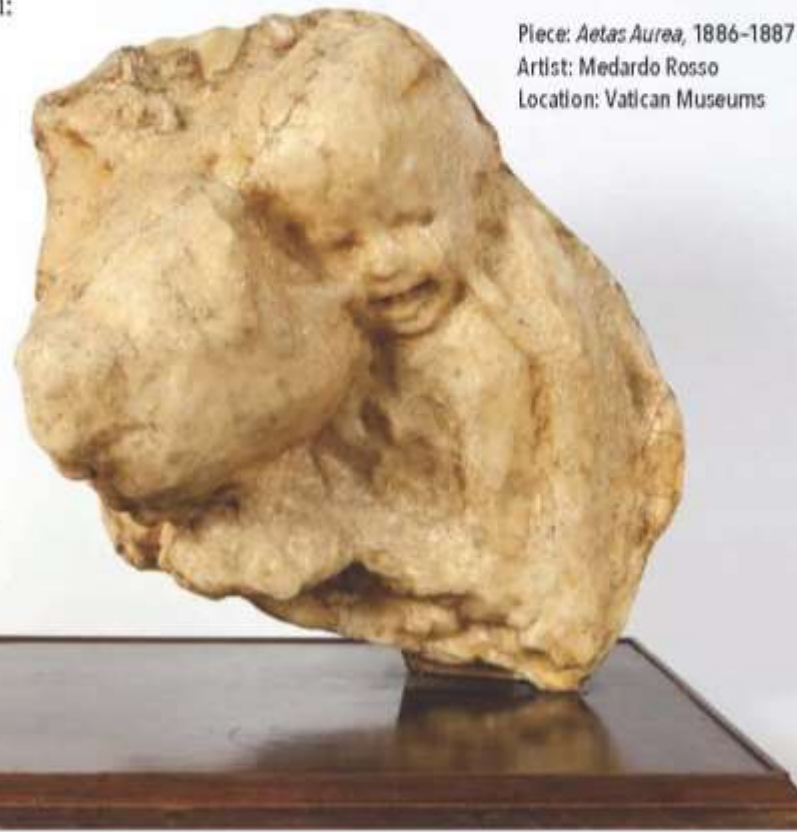
Piece: Aetas Aurea , 1886-1887 Artist: Medardo Rosso Location: Vatican Museums

How can I express greater tenderness toward my loving Father?