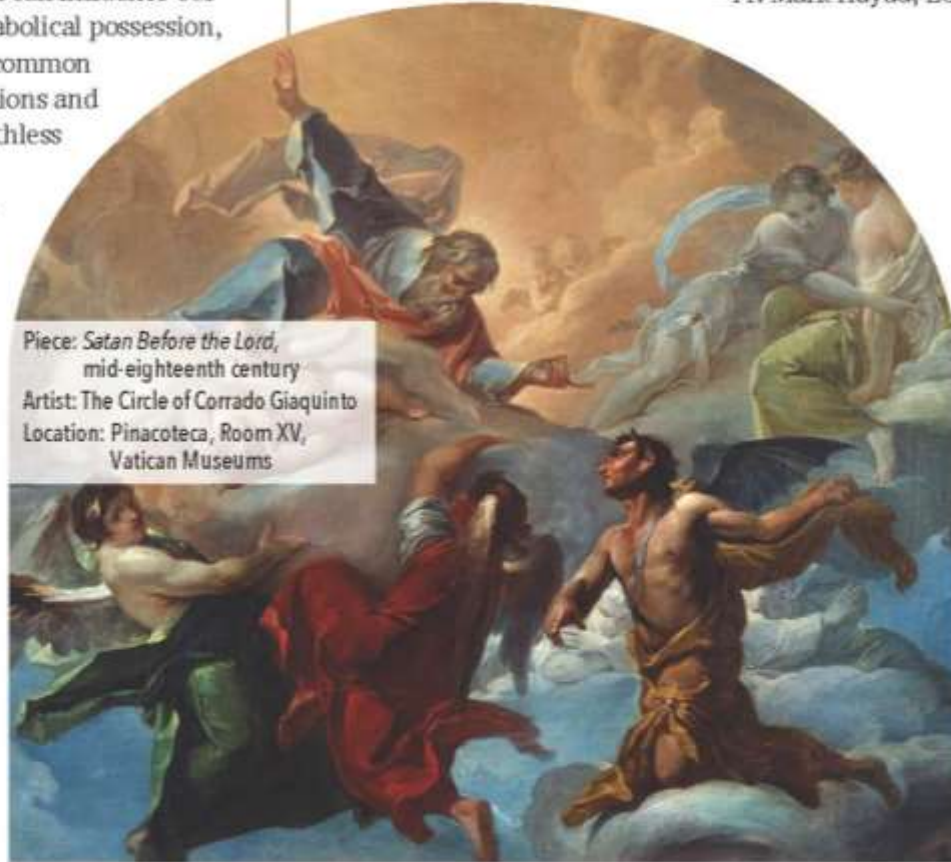
Piece: Satan Before the Lord , mid-eighteenth century Artist: The Circle of Corrado Giaquinto Location: Pinacoteca, Room XV, Vatican Museums