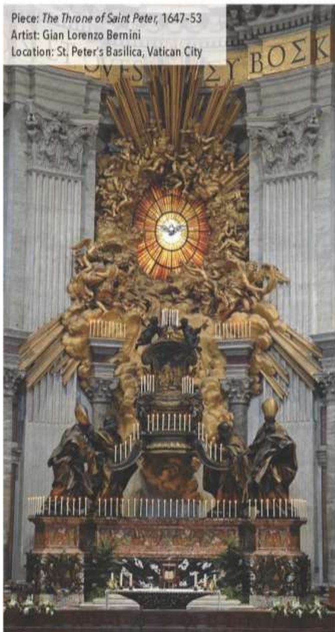
Piece: The Throne of Saint Peter , 1647-53 Artist: Gian Lorenzo Bernini Location: St. Peter's Basilica, Vatican City

August 27, 2017 Twenty-First Sunday in Ordinary Time (A) Is 22:19-23 Rom 11:33-36 Mt 16:13-20