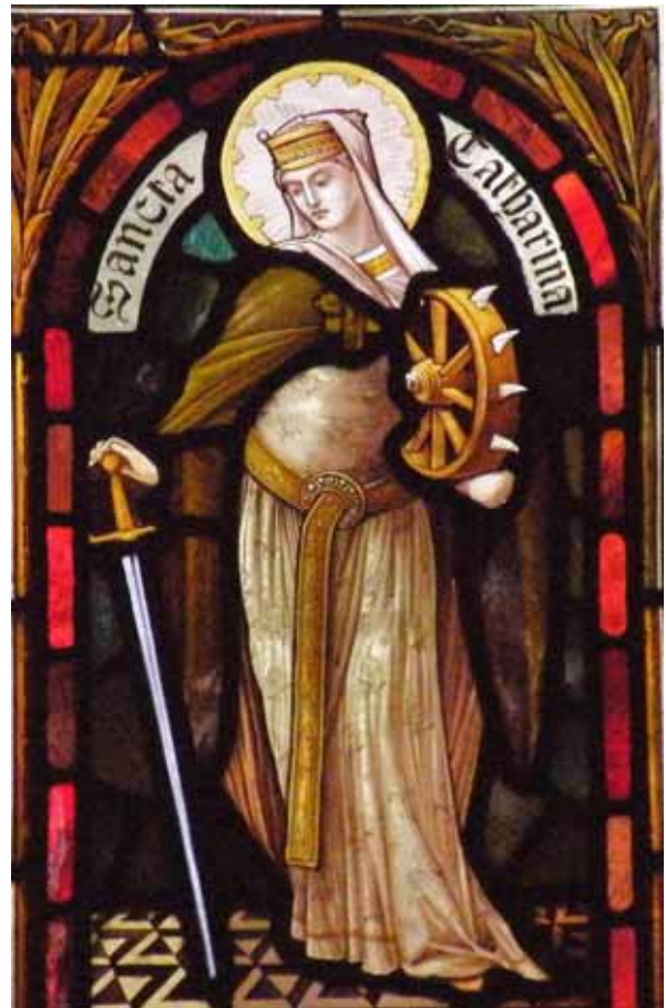
ST. CATHERINE PRAY US!

Whoever wants to be the greatest has to become the least and the servant of all.