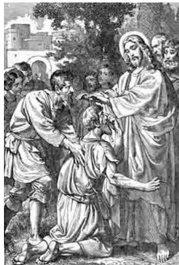
Sixth Sunday in Ordinary Time