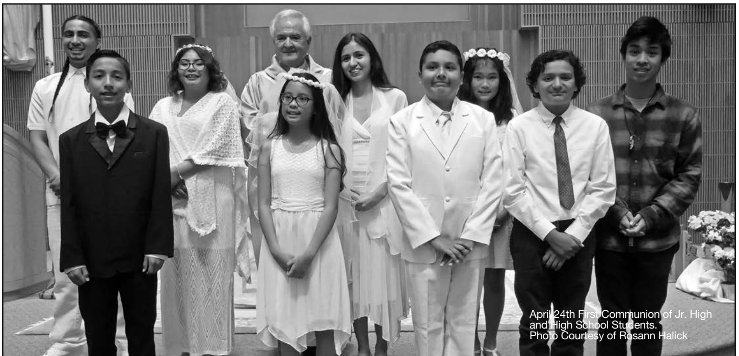
April 24th First Communion of Jr. High and High School Students.