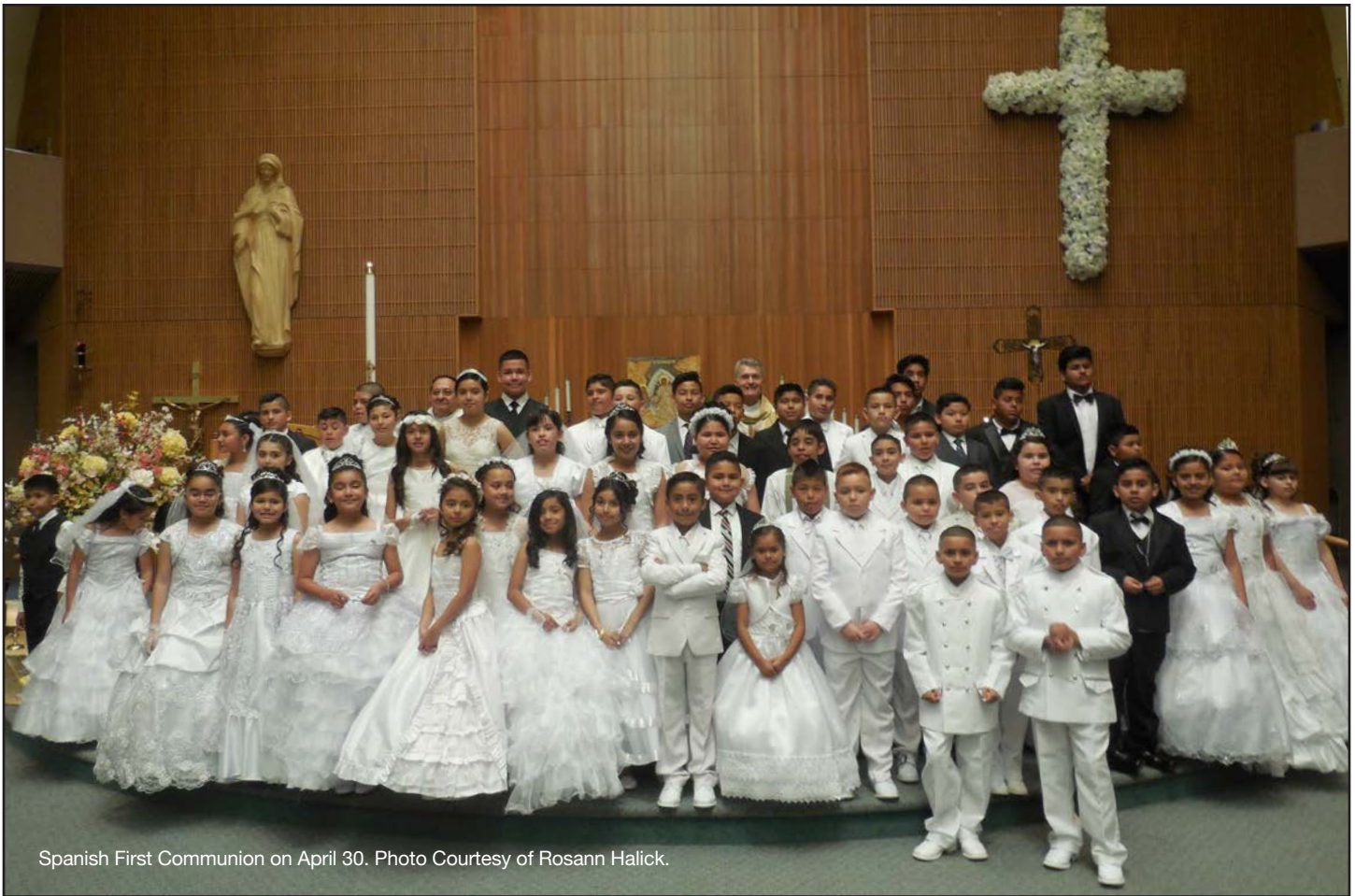
Spanish First Communion on April 30.