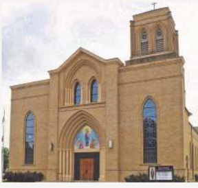
Our Lady of the Most Holy Rosary Roman Catholic Church 602 N. Church Ave Kaplan, LA 70548