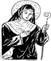
St. Scholastica, Virgin

Twins often share the same interests and ideas with an equal intensity. Therefore, it is no surprise that Scholastica and her twin brother, Benedict, established religious communities within a few miles from each other.